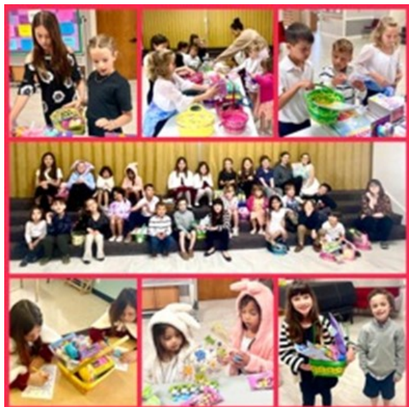
Easter baskets readied for foster children