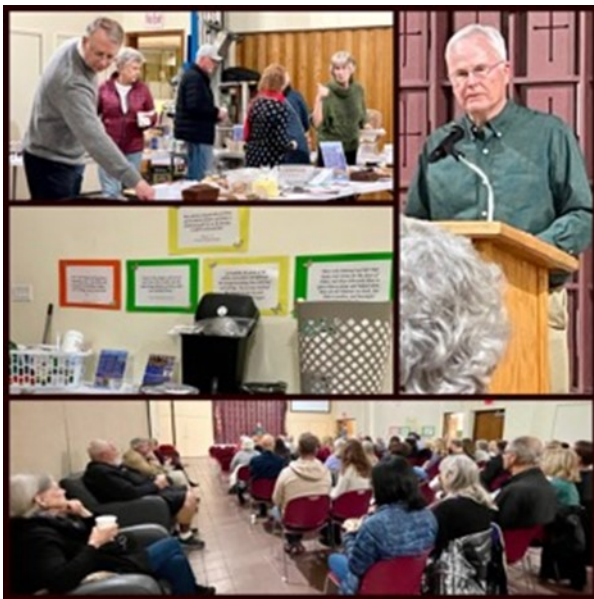
Conejo Interfaith Refugee Team event on March 3