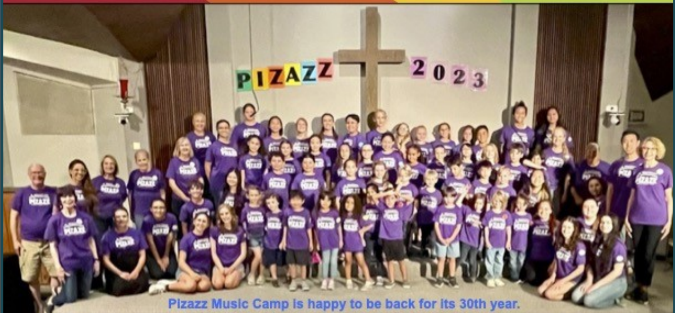
Pizazz Music Camp is happy to be back for its 30th year.

Details & Apply online at www.PizazzMusicCamp.org Applications being accepted now! Save $30 by June 1