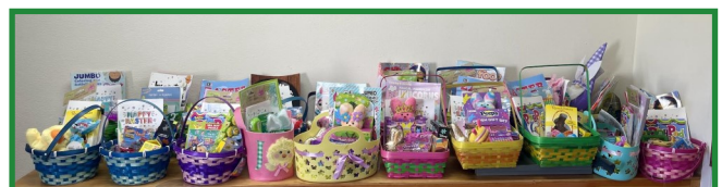
21 Easter baskets were assembled in Sunday School for delivery to James Storehouse