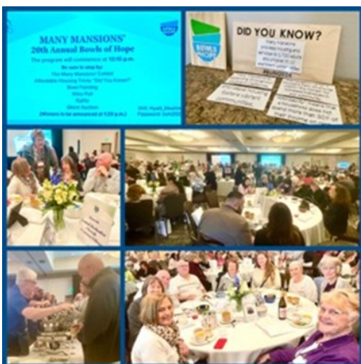
"From Empty Bowls to Hopeful Homes"