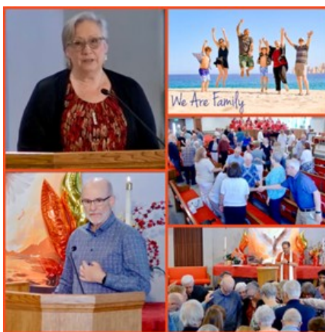
Congregation greeting time & farewell blessing