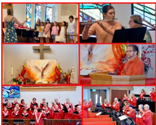
Lots of Music on Pentecost