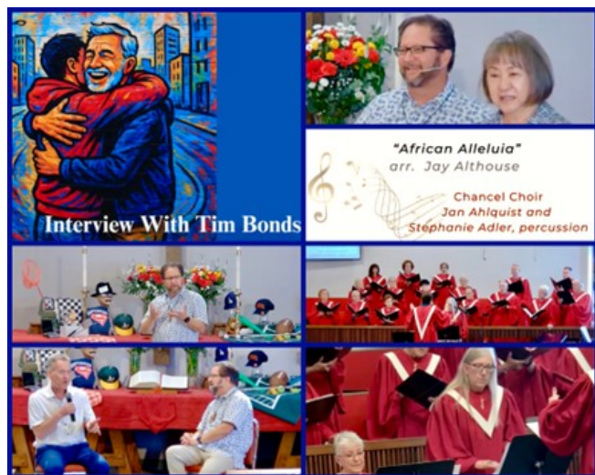
Father's Day Worship in the Sanctuary