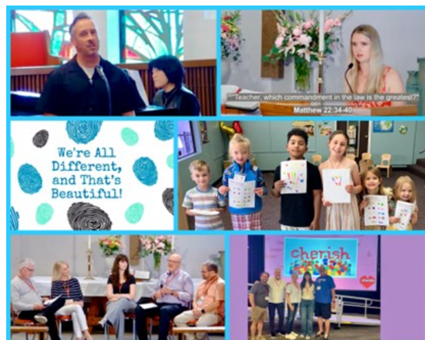
Worship & Sunday School on June 22