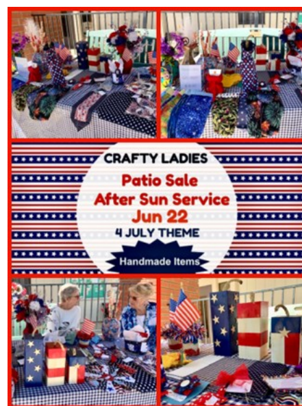
Crafty Ladies' Sale on the patio