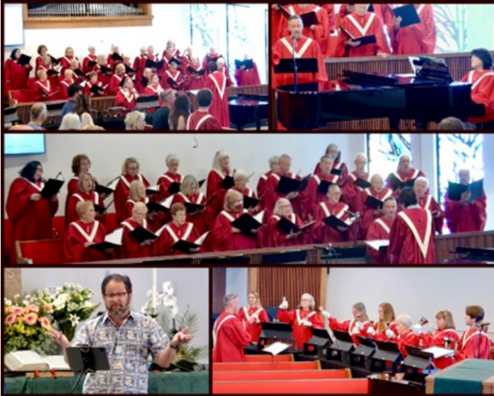
The Chancel Choir & Covenant Ringers were back