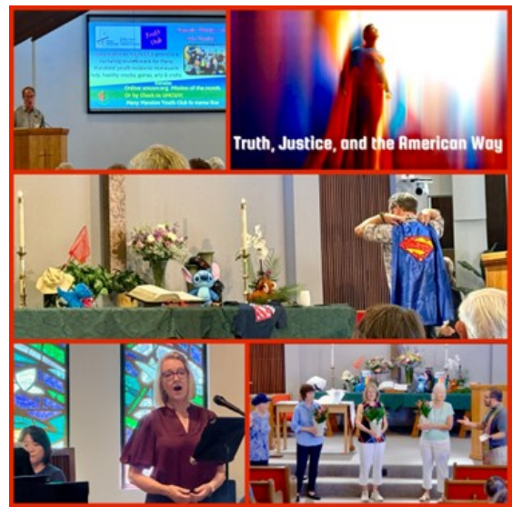
"Superman" Sunday worship, Aug. 10

Save the Date now for Pizazz 2026 - July 20-24!