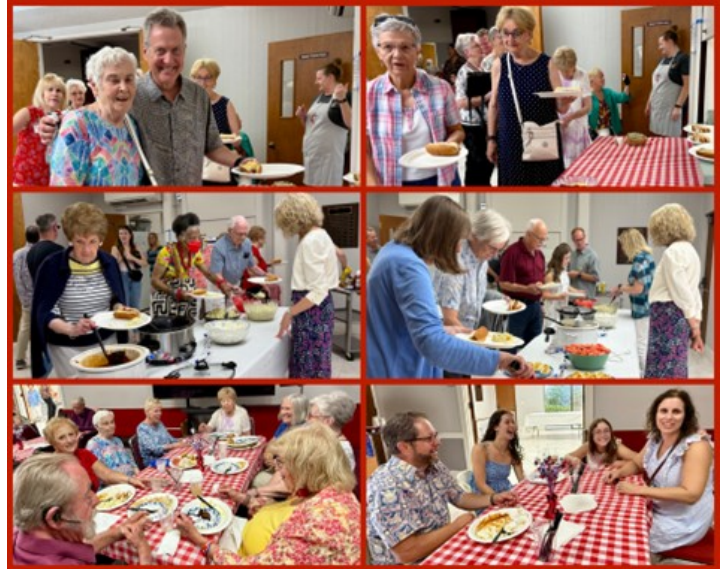
Hot dog lunch, with lots of side dishes, in Alton Hall