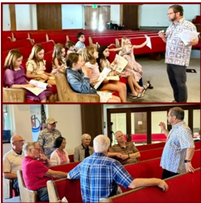
Training for acolytes and ushers

Training sessions for acolytes & ushers were held after worship on Aug. 10 and Aug. 17, respectively. The children are so eager and proud to take turns being an acolyte. It was nice to welcome four new people who trained to be ushers - to help out the three others who have been regulars for a while. By the way, ushers don't just pass the offering plates and guide people on communion Sunday. They also stand at the sanctuary entrance and warmly greet people to worship on Sunday mornings, so this is an important welcoming ministry.