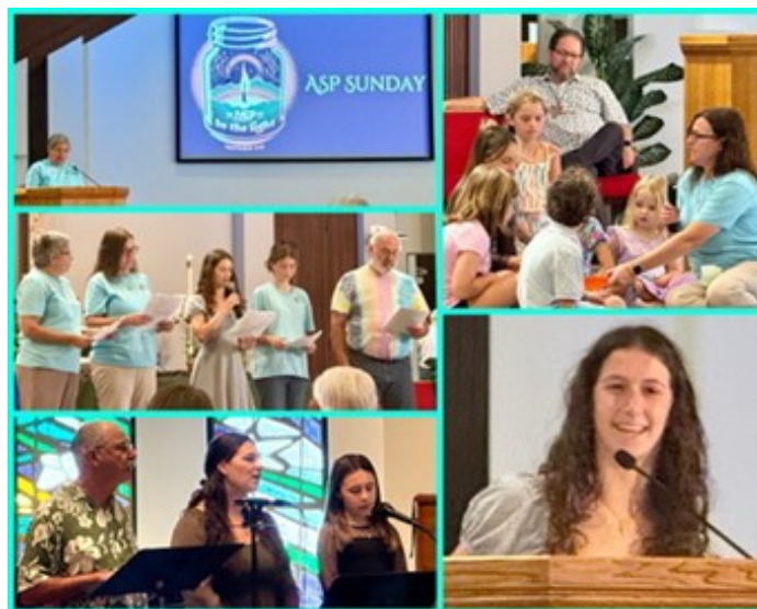
ASP Sunday, Aug. 17