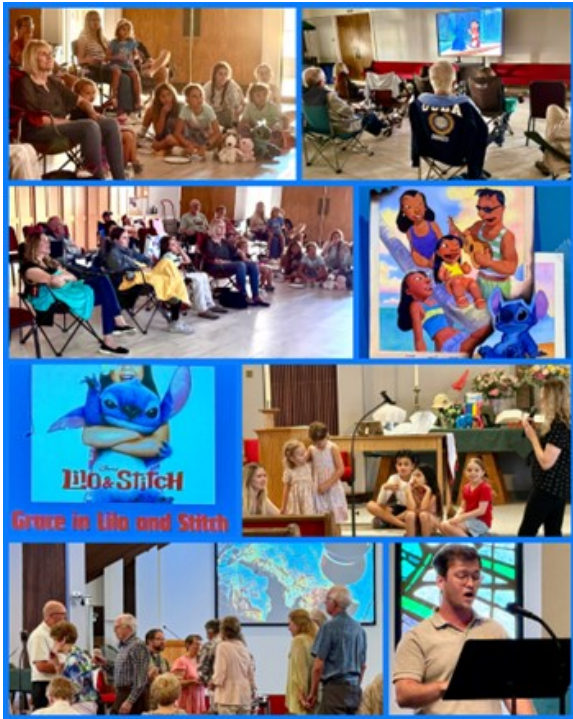
Lilo & Stitch emphasis on Aug. 1 & 3