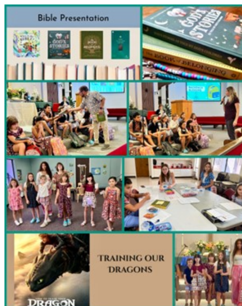
Kick-Off Sunday Kids' Activities